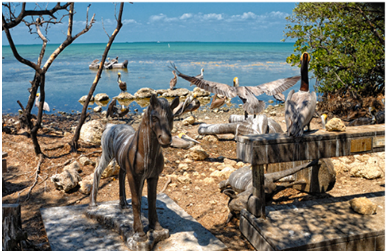
Documentation of sculptures while installed at the Florida Keys Wild Bird Center, to live with rehabilitating wild seabirds and acquire a patina of guano on the faux bronze surface.