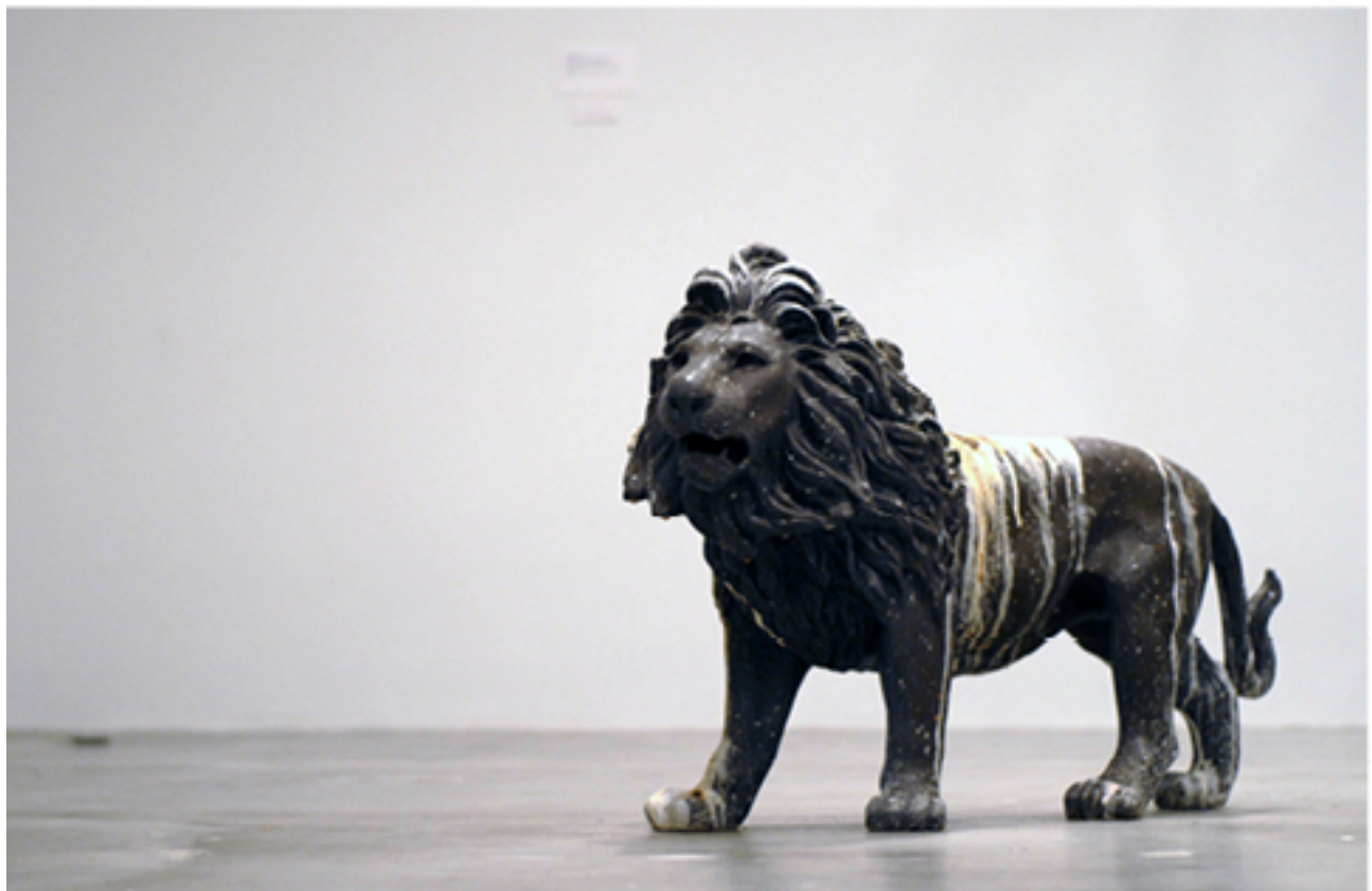
(Above) Documentation of sculptures installed at the Florida Keys Wild Bird Center to live with rehabilitating wild birds. (Below) Installation detail